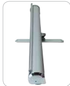
Swivel foot base