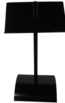
Slide literature pocket over top of pole system and tighten thumb screw. 3