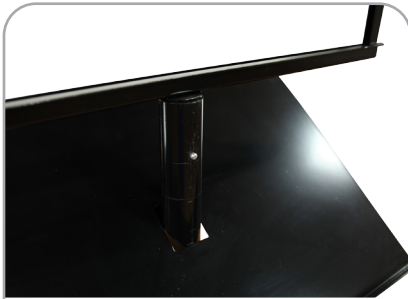
Press push pin and line up with hole in pole system. Release to secure. 5