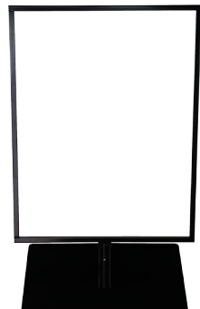
Insert graphic into graphic holder. 6