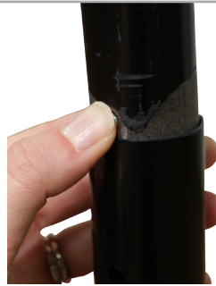
Insert second pole into base pole. Press push pin and line up with hole in bottom pole to lock. 2