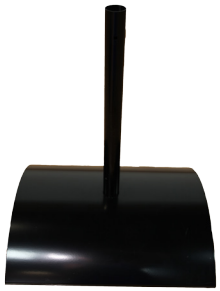
Bottom pole and base are attached. 1