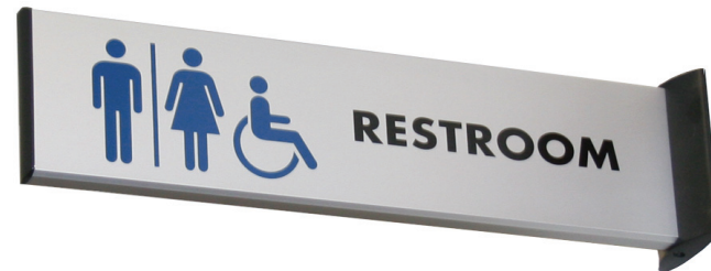
Projecting Signs - Flat