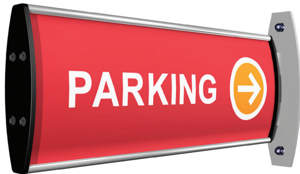
Projecting Signs - Landscape