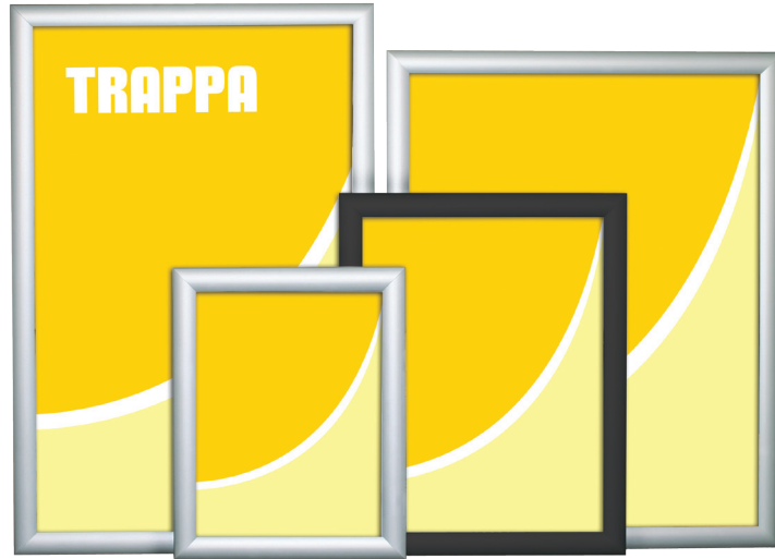
Trappa Snap-Edge Poster Frames